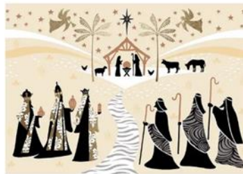
The Christmas Story. Single design. Pack of 10. £3.95p