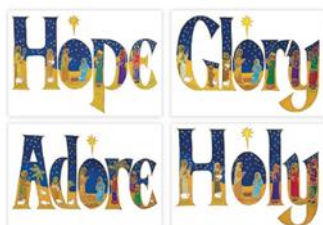
A Saviour is Born: 4 designs. Pack of 20 cards. £4.95p