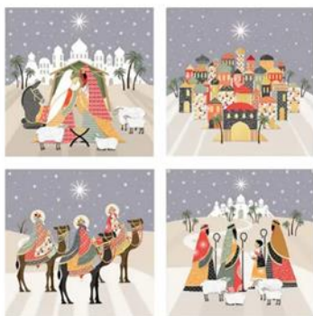
Patchwork Christmas: 4 designs. Pack of 20 cards. £4.95p

Jan Wallace will be selling Traidcraft Christmas cards this year. The following are samples, with more to be found in the POD or the church.